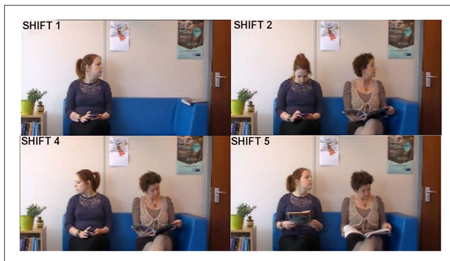
Figure 1. Screen shots of the video used by Gregory et al. (2015) and this study showing the four gaze shifts performed by the actors.