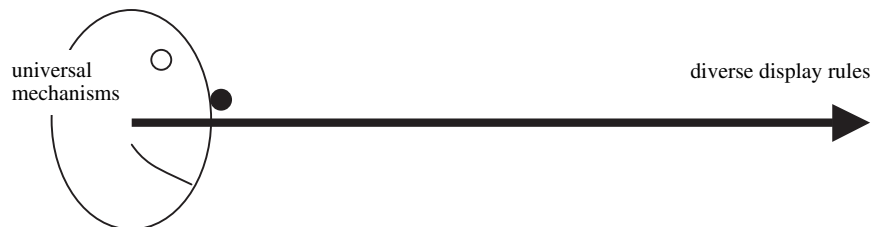
Figure 13-1. The expression of emotions as a sequence from universal to local steps.