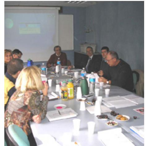
Regionalmeeting in Valence

as under the Synonym „ Flock-technology Competence Centre “ in HALL 4, STAND C 73