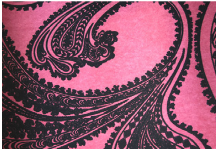
Wallpaperdesign by Cole and Son, London