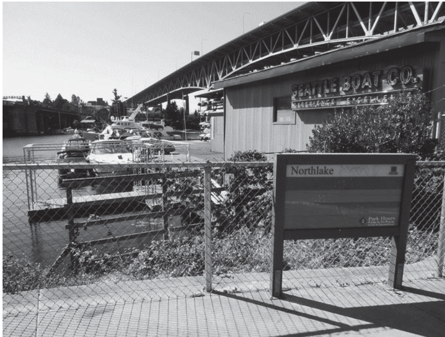
Figure 2: “The elusive character of Northlake,” as depicted by waterfront park signage lacking an obvious signified point of reference

transformations, making it a productive location for place-based transdisciplinary inquiry into the larger patterns and processes of urbanism.