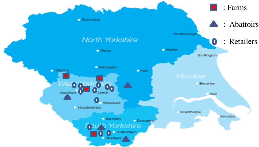
Fig. 2. Locations of candidate facilities in Yorkshire of the UK.

Figure 2 illustrates the locations of candidate facility in the considered region (Yorkshire/UK) which includes four farms, four abattoirs and eleven retailers.