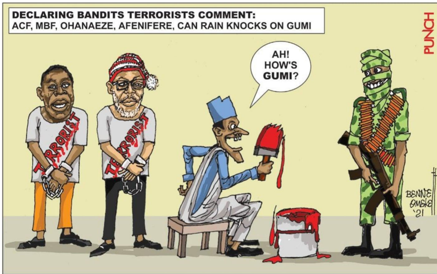
Figure 4. Tagging separatists as terrorists.

which followed peaceful protests, sensitization, and awareness creation among the Yorubas of southwestern Nigeria (Figure 4).