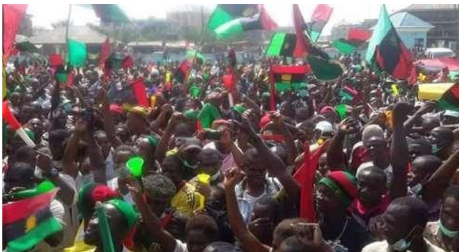
Figure 1. IPOB members during a rally.