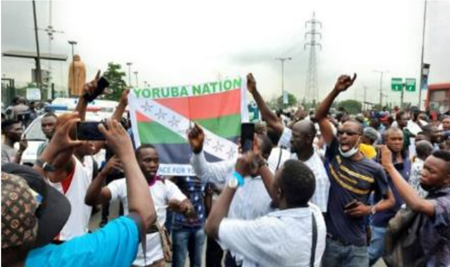
Figure 3. Yoruba Nation's separatist movement.

for Yoruba self-determination in his musical documentation entitled 'Yoruba Ronu', meaning that Yoruba should have a deep thought. He pleaded that Yorubas, who represent one of the dominant ethnic groups in Nigeria, should look back and observe their greatness. However, his message was ignored by the Yoruba people. Another reflection of such calls for liberation was made by the late Chief Obafemi Awolowo, the former Premier of Southwestern Nigeria. He argued that the time is coming when the Yoruba people will advocate for self-liberation from Nigeria's political enslavement (Akinterinwa 2020).