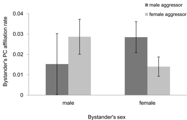
Figure 3. Bystander affiliation rate in relation to the aggressor's sex and bystander's sex. Bars represent mean post-conflict affiliation rates \pm 95% confidence intervals. doi:10.1371/journal.pone.0022173.g003

aggressive tendencies. Our findings also suggest that this post-conflict behavior could act as substitute reconciliation in that it is more common when opponents have failed to reconcile. Bystander affiliation toward aggressors is provided most often by adult males and directed toward high ranking males, whereas females engage less often in this behavior both as actors and recipients.