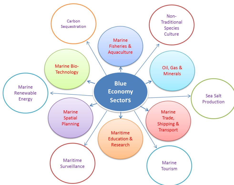
Fig. 2. Major sectors related to blue economy in Bangladesh

Bay of Bengal and coastal regions are the backbone of national economy of Bangladesh. The blue economy can create enormous opportunities to resolve the issues of climate changes at the coastal areas by addressing the challenges. On the other hand, it might generate jobs for millions and bring about tangible changes in the lives and livelihood of the millions of people living along the coastline, in islands and across Bangladesh, if the marine based economic resources belonging with many sectors are managed and governed by principles of biodiversity protection, conservation is community-led and efforts for care are intertwined with a vision of scientific understanding. The past and present status and trends and future potentials of marine based economic resources (Living, non-living and potential other resources) within the identified sectors are summarised in Table 1 and major opportunities of these sectors are detailed in the following paragraphs.