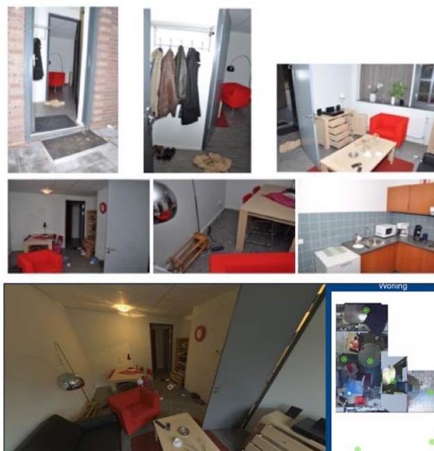
Figure 1: photos of the scene of the crime. The bottom photo on the left shows the outlook of the scene on the computer, the picture on the bottom right shows the plan of the house from a view from above. The green dots can be clicked on to view the house from another angle.

and out. In addition, participants were provided more detailed photographs of the scene on paper. Figure 1 shows photos of the scene and the outlook of the panoramic scene on the computer.