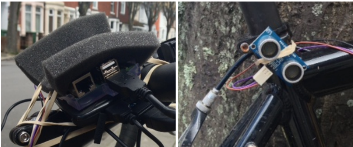
fig1. The First Prototype

A first prototype was created in March 2013. We used a lot of rubber bands, foam, a Raspberry Pi, a GPS unit, a battery pack, and a single ultrasonic sensor attached to the seatpost.