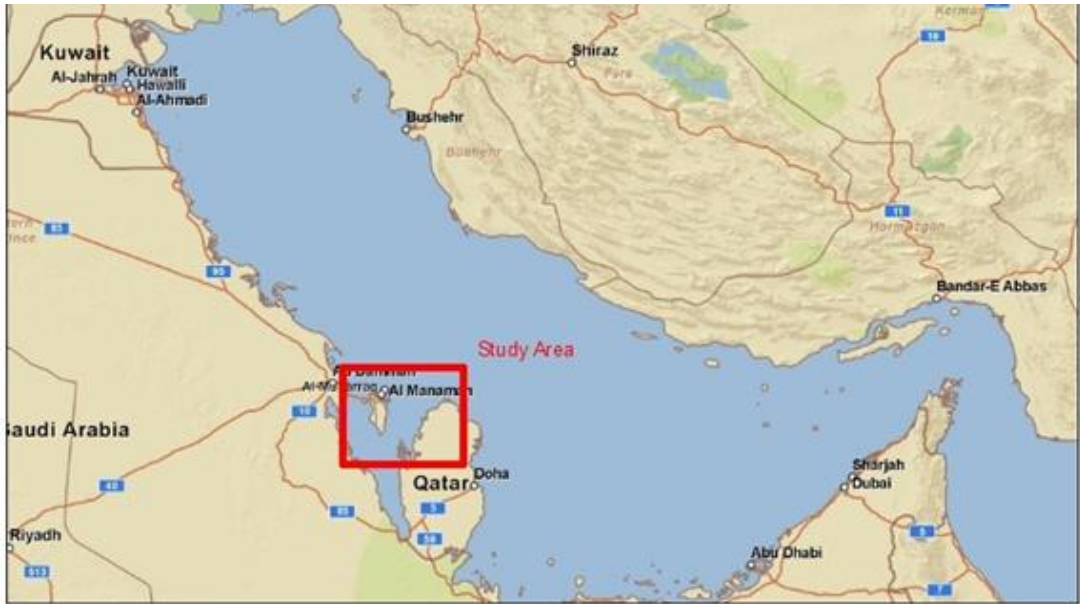
Map 3 Location of Bahrain in the Gulf.