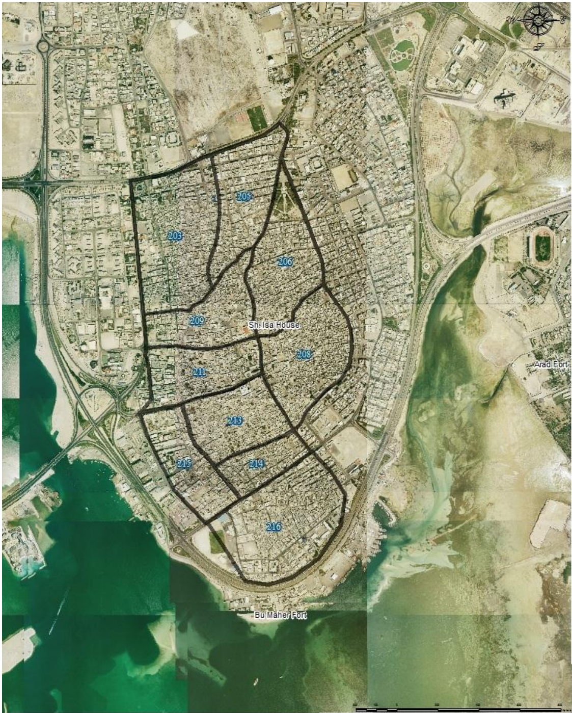
Map 5 Muharraq island showing the study area marked with block numbers.