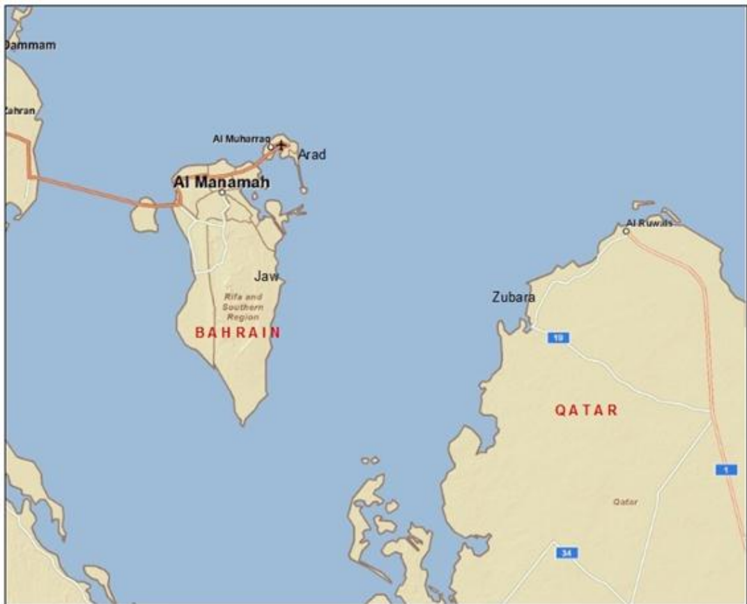
Map 4 Location of Muharraq and Jaw with respect to Qatar and the Middle East.