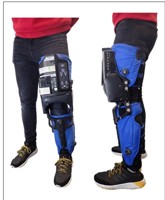
Figure 1. Front and side view of the over-ground robotic-assisted gait training device (Alter G Bionic Leg orthosis, Fremont, CA, USA).

All participants randomized into the over-ground robotic-assisted gait training program completed a