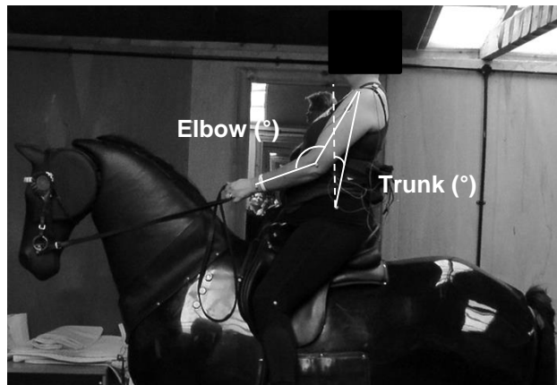
Figure 1: Lab set-up and angle conventions

Marker coordinates were used to calculate the maximum and minimum heights (mm) of each marker over the four cycles. Angles (°) were determined for the participant's trunk segment and elbow joint. Trunk angle was measured relative to the vertical for a line joining the hip and shoulder; tilting the upper body backwards was assigned a positive value. Elbow angle was always positive, with smaller angles indicating greater flexion.