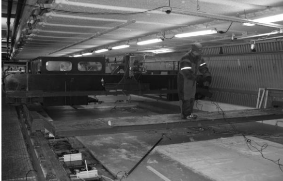
Figure 1: photograph of experimental setup.

Figure 1 is a photograph which gives an indication of the scale and configuration of the experiment. The normal load here is provided by hydraulic pusher frames, visible in the bottom left of figure 1. The frictional shear force is provided by a cantilever beam attached to the bottom of a controllable mechanical carriage, visible in the background of figure 1. Both the normal load frames and the shear load beam were fitted with calibrated load cells. The speed at which the ice was pushed was controlled by a relatively crude control on the carriage, but was accurately measured using calibrated displacement transducers. The effective friction coefficient \mu is then given as half the shear load divided by the normal load (the factor of two occurs since there are two sliding edges.)