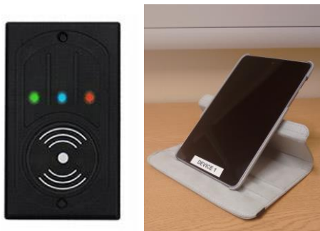
Figure 1. Orbit IP card reader (left) and a portable reader (Right)

The reader’s firmware was customised to extract and decrypt student ID data before sending it on to the ingestion server. The centre LED’s that was used to indicate that the device was active was changed from amber to blue.