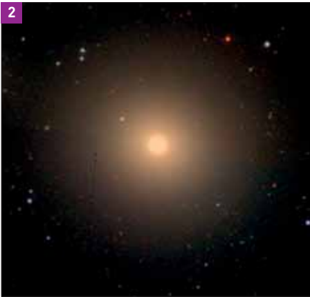
2: In the optical, NGC 3379 looks like a typical elliptical galaxy; ATLAS 3D revealed the smooth structure hides a rotating disc.

MEETING REPORT Chris Lintott and Karen Masters review progress in understanding galaxy morphology, as discussed at this RAS meeting.