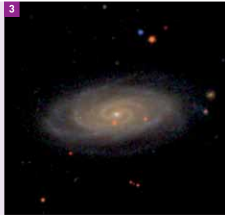
3: IC 756 is a remarkable galaxy. Despite having no visible bulge, it hosts an actively growing supermassive black hole.