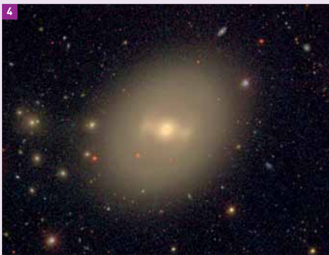
4: What looks like a bulge at the centre of NGC 936 might actually be part of the bar. (All SDSS)

common in more massive, redder and less star-forming disc galaxies, as we shall see below.