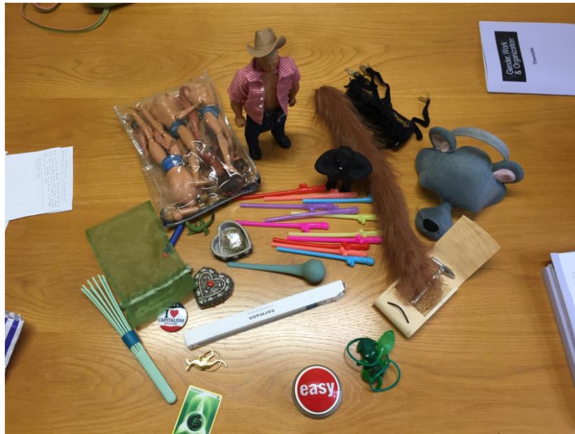
Figure 1: Objects at the GWO conference space

cock (or napkin) ring ↔ some cock-shaped straws ↔ Fragments of male dolls ↔ and ↔ and ↔ and ↔ (Figure 1).