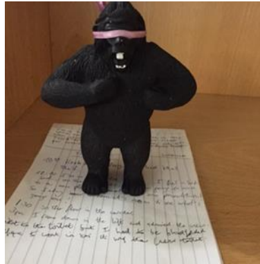
Figure 3: Gorilla in bandana

and answers check the presentation until last minute and do not listen to other