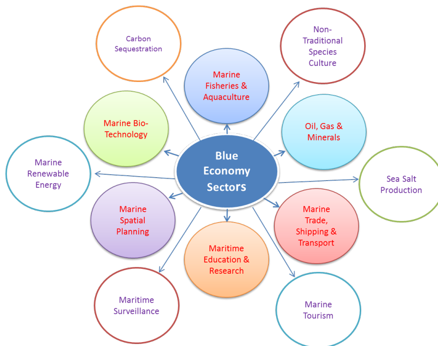
Fig. 3. Major economic sectors related to blue economy in Bangladesh (Hussain et al. 2017a; Hussain et al. 2017b)

Meanwhile, in Bangladesh within its present maritime boundary, a total of 26 productive blue economy development and economic sectors have been identified for full utilization of ocean-based resources. Among these, the major economic sectors are: i) Marine Fisheries and Aquaculture; ii) Marine Non-Traditional Species Culture; iii) Marine Biotechnology; iv) Carbon Sequestration; v) Oil, Gas and Minerals Mining; vi) Ocean Renewable Energy; vii) Sea Salt Production; viii) Marine Trade, Shipping and Transport; ix) Marine Tourism; x) Marine Education and Research; xi) Maritime Surveillance; xii) Marine Spatial Planning etc (Fig. 2). Under the blue economy approach within a comprehensive framework of ecosystem based management, if ocean spaces are properly planned and managed to carryout inter-sectoral coordination with public-private partnership and investment, it will certainly generate strong foundation of huge earnings and economic benefits for the country.