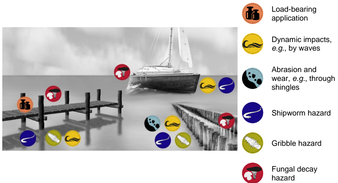
Fig. 1. Portfolio of abiotic and biotic hazards relevant for marine structures (Illustration: Treu et al. 2018)