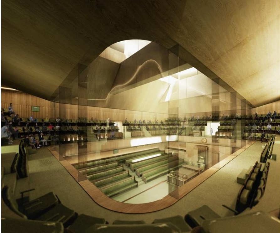
1 Indicative image of the temporary House of Commons Chamber. Source:Alford Hall Monaghan Morris

Walter Menteth Project Compass . London 12 May 2019 i