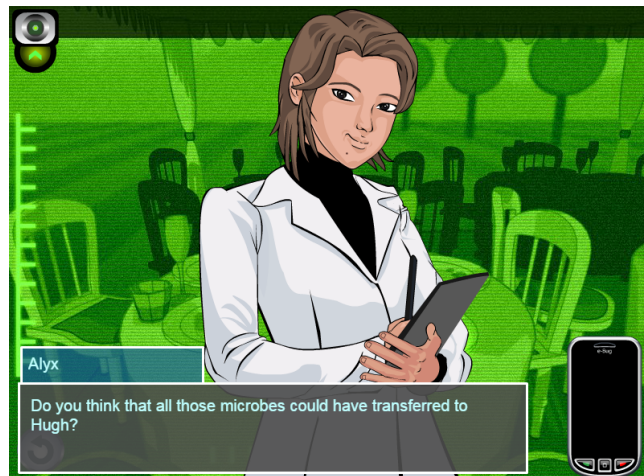
Fig. 1. Example of an In-Game Assessment Question

In the interactive digital storytelling based game, the questions and all the narratives are delivered through conversation nodes. A conversation node is a narrative displayed to the player at a certain point in time. Each question offers the player multiple options to choose from. Depending on the choice the player makes, the game changes and the interactive digital storytelling based game provides the player with a different